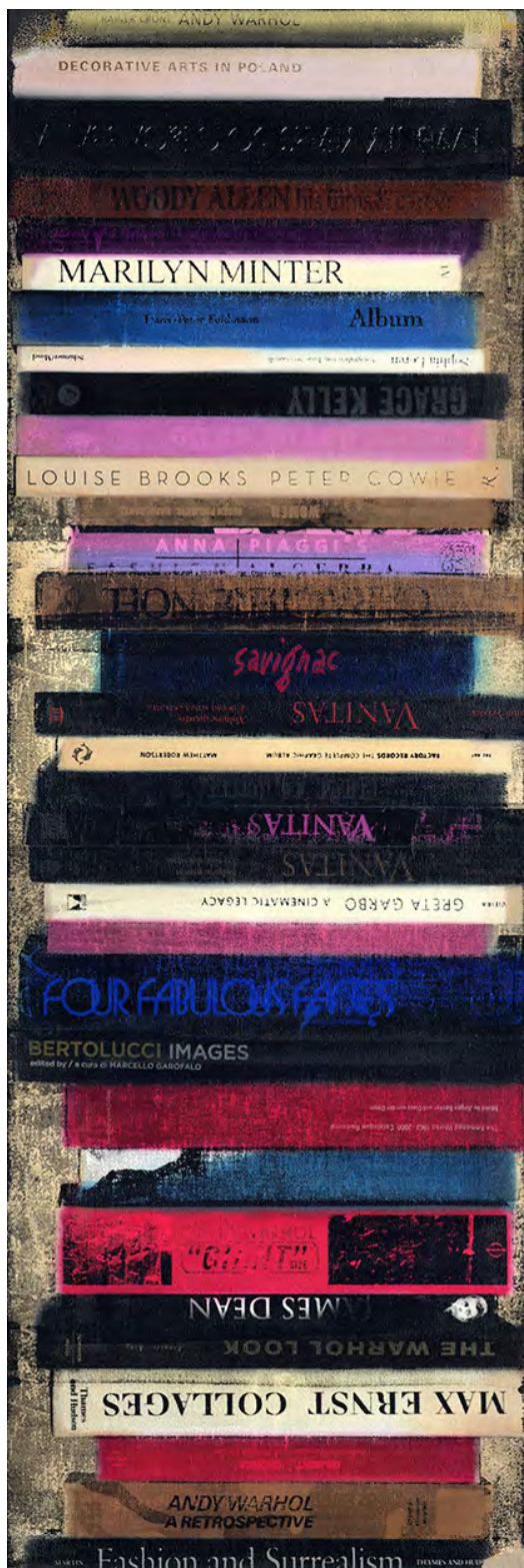
Artbooks JS-11 2012 Original h1500 x w500 mm Silkscreen and Oil on Canvas