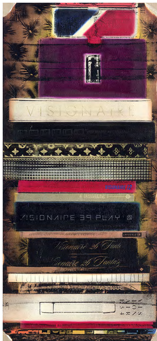
Artbooks YM-01 2012 Original h1135 x w530 mm Silkscreen and Oil on Canvas